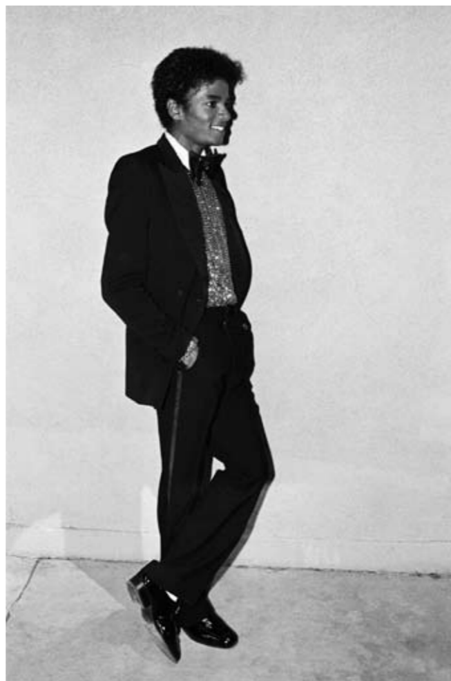
MICHAEL JACKSON AT CHASEN'S RESTAURANT 1978

Yes, believe it or not, this is Michael Jackson. I am not a fan of Michael Jackson. I met him a few times over the years, once with Tatum O'Neal and at a bunch of parties. This photo was taken on the sidewalk at the old Chasen's Restaurant. They had the best chili and fried chicken. The party was for some award show and once again the photos inside were boring. What I like about this photograph is the stain on the sidewalk.