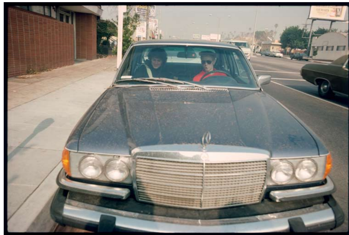
I WAS A TEENAGE PAPARAZZO 1975:

Yes, believe it or not, this is Michael Jackson. I am not a fan of Michael Jackson. I met him a few times over the years, once with Tatum O'Neal and at a bunch of parties. This photo was taken on the sidewalk at the old Chasen's Restaurant. They had the best chili and fried chicken. The party was for some award show and once again the photos inside were boring. What I like about this photograph is the stain on the sidewalk.