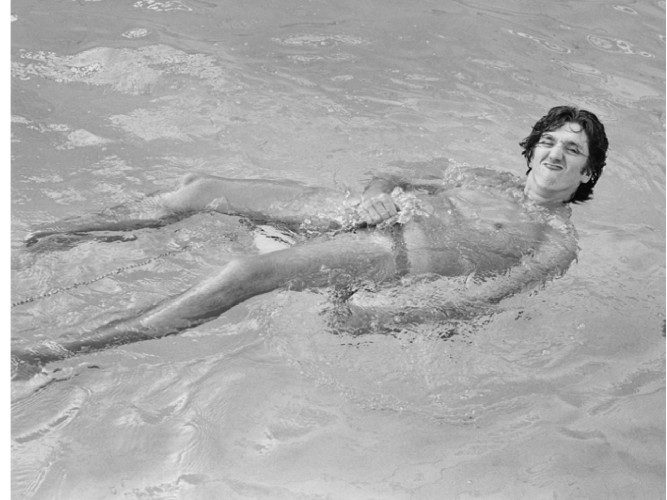
STEVE JONES - 999 N. DOHENY 1978: