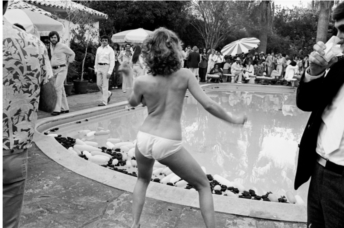
BEHIND THE BEVERLY HILLS HOTEL NO 3, 1977: