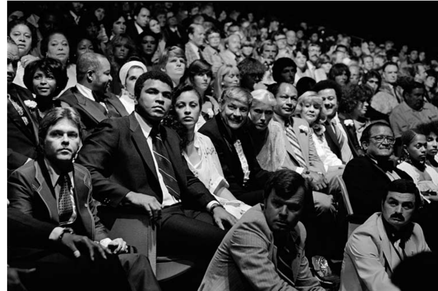
Ali And The Sea Of Faces 1979: